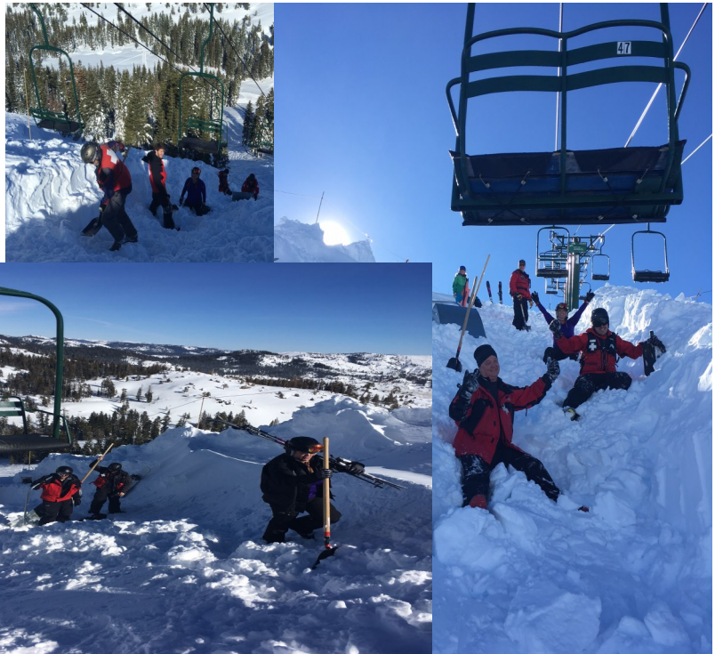
Are we having fun yet?