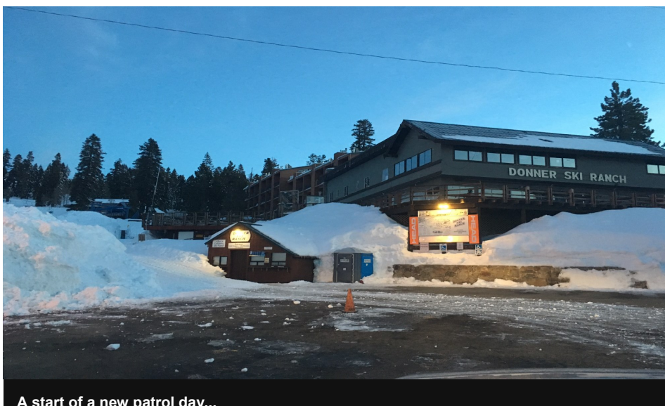
A start of a new patrol day...